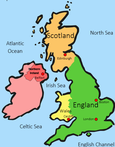
Map of the U.K.