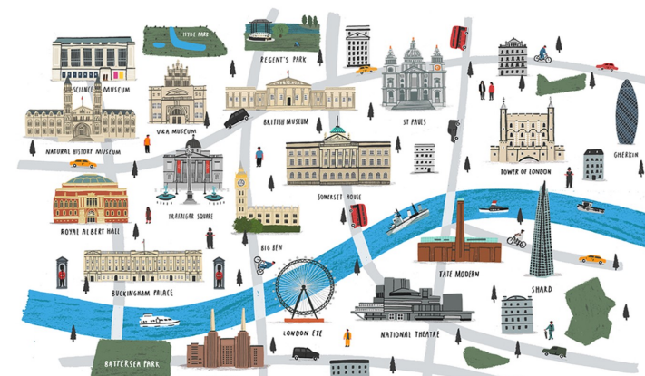
Modern Day London Landmarks

https://kids.kiddle.co/Great-Fire-of-London